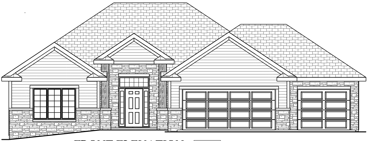
FRONT ELEVATION NV28615