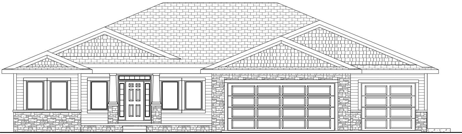
FRONT ELEVATION NV26219