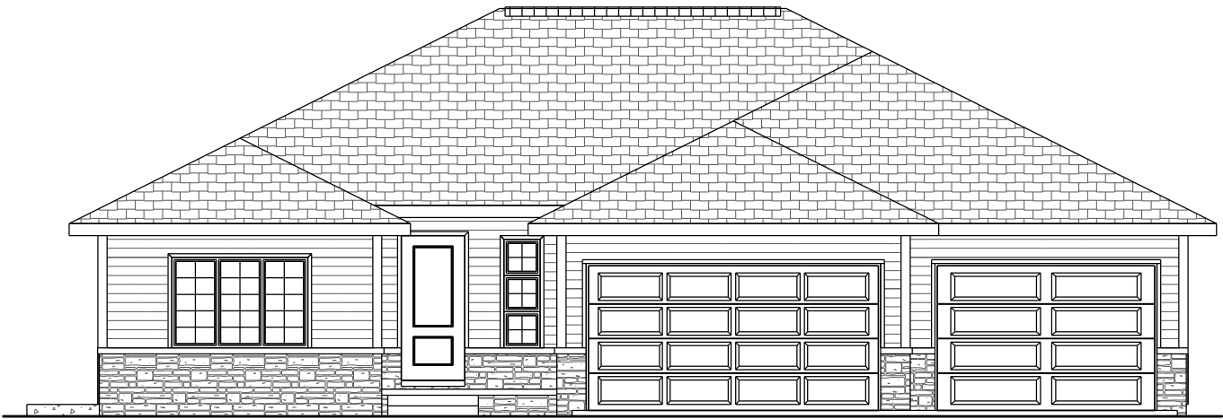
FRONT ELEVATION NY25119