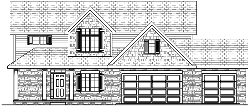
FRONT ELEVATION NV21208