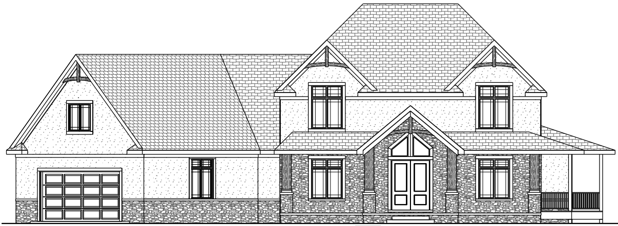
FRONT ELEVATION NV17114