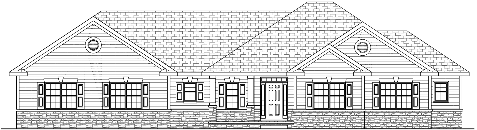
FRONT ELEVATION NV10219