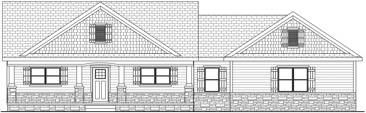
FRONT ELEVATION NV10019