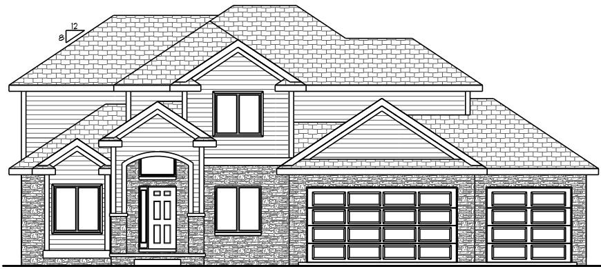
FRONT ELEVATION NVO9115