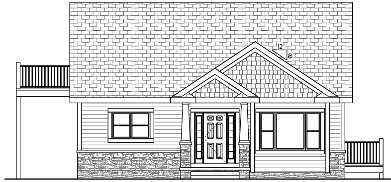
FRONT ELEVATION NV07115