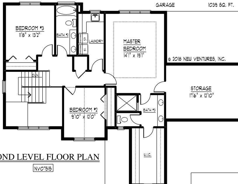
SECOND LEVEL FLOOR PLAN