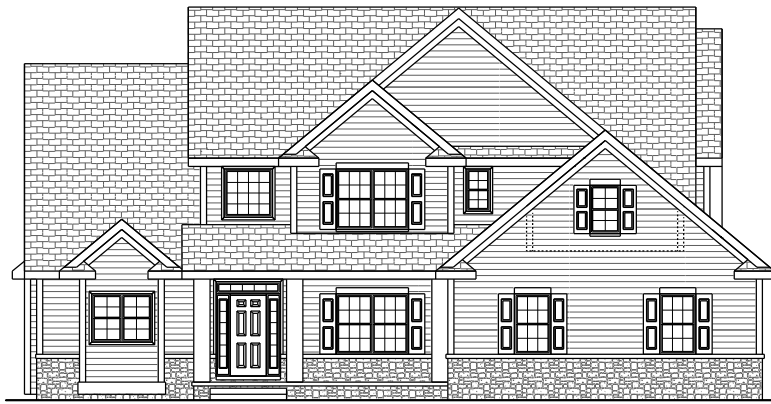
FRONT ELEVATION NV07014