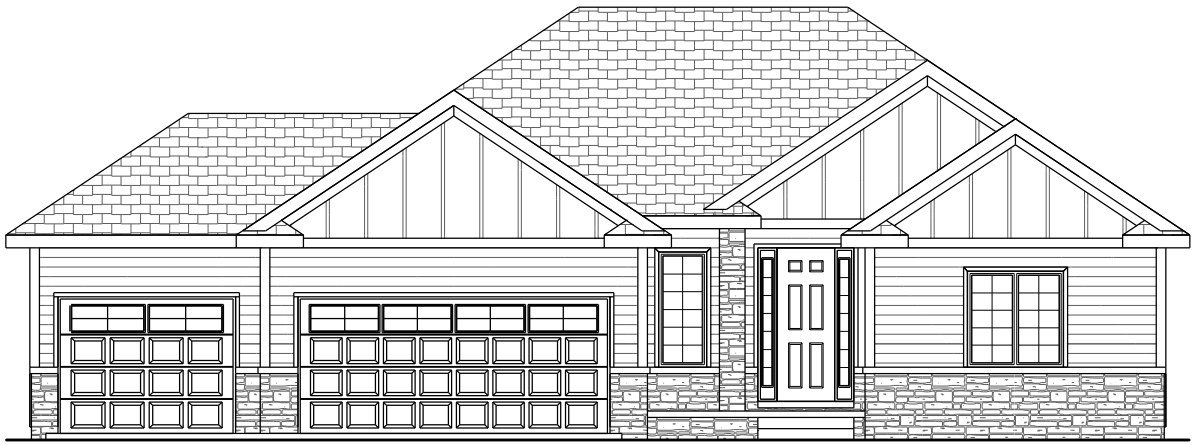
FRONT ELEVATION NV06816