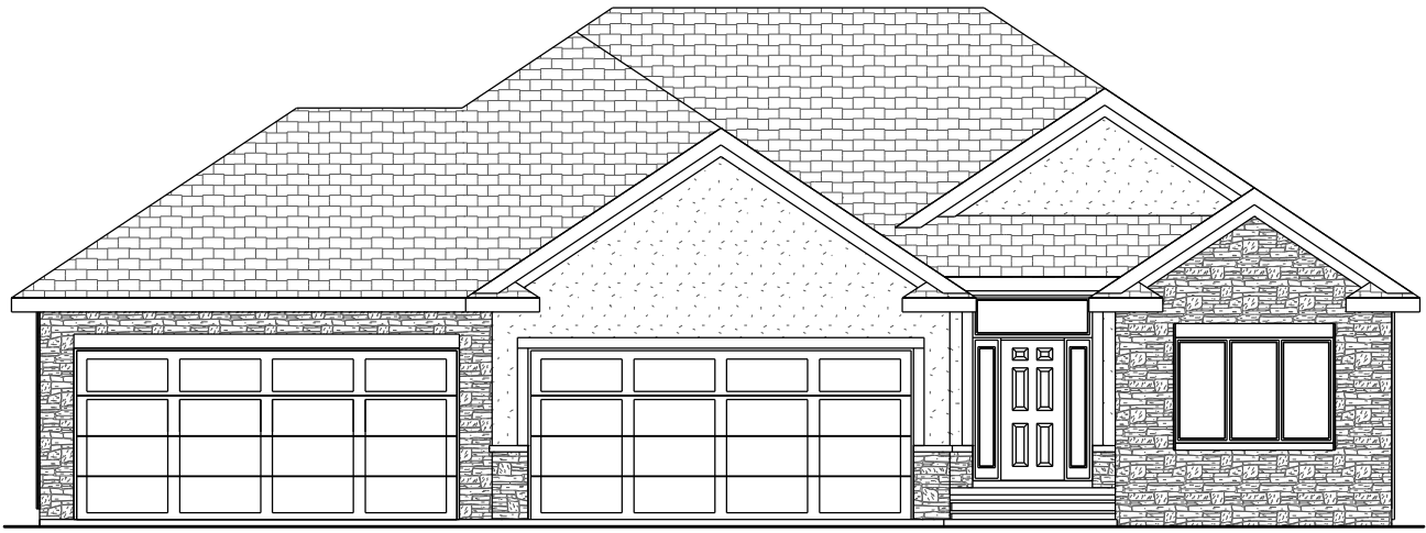
FRONT ELEVATION NV05419