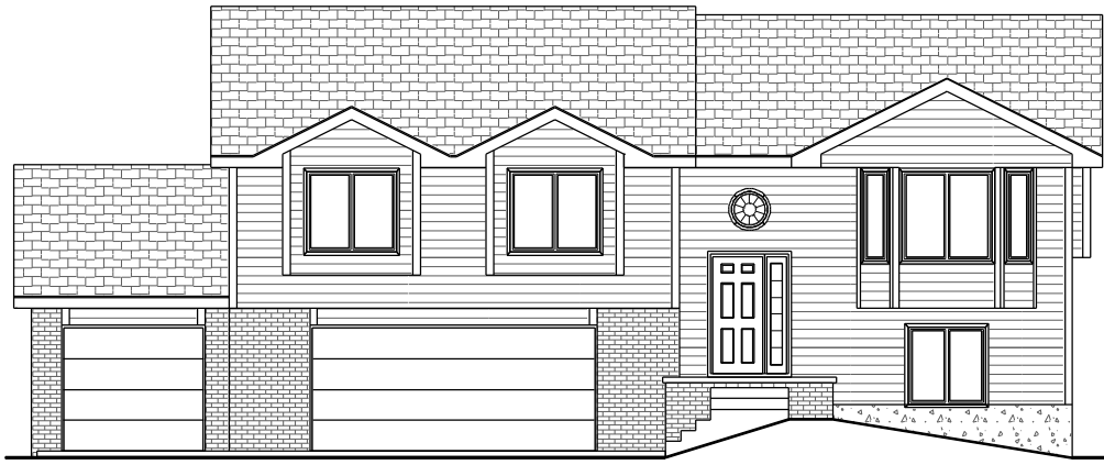
FRONT ELEVATION NV40702