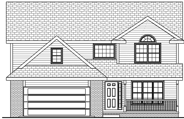
FRONT ELEVATION NV34706