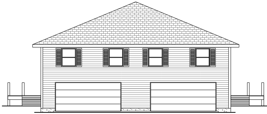
FRONT ELEVATION NV34704