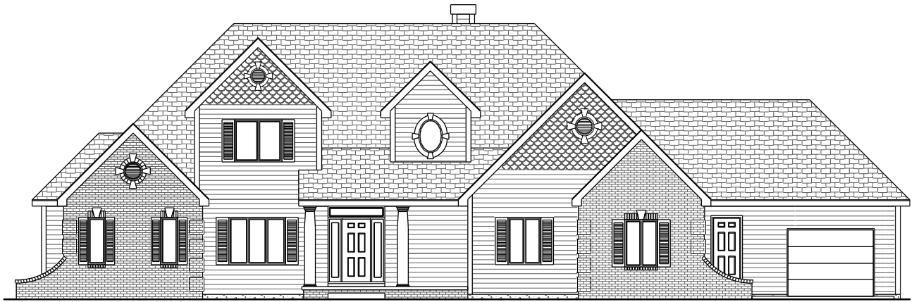
FRONT ELEVATION NV31302