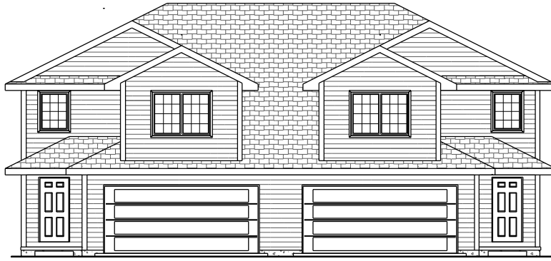
FRONT ELEVATION NV29806