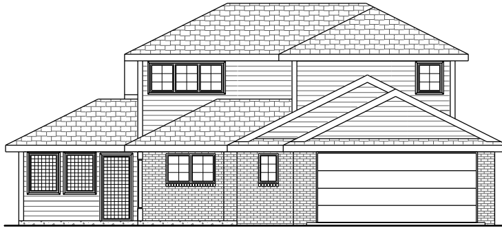
FRONT ELEVATION NV28605