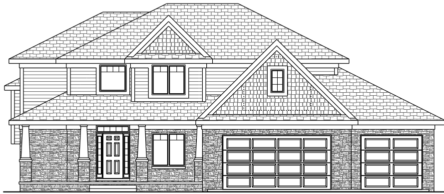
FRONT ELEVATION NV26112