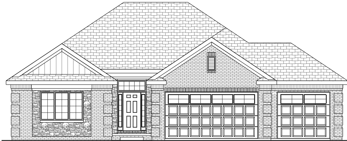
FRONT ELEVATION NY26012