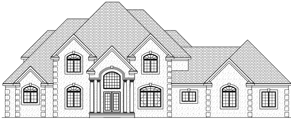
NV24603 FRONT ELEVATION