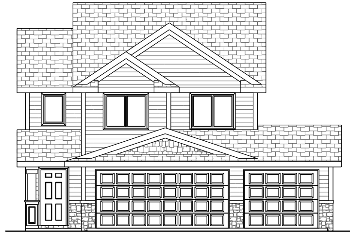
FRONT ELEVATION NV21808