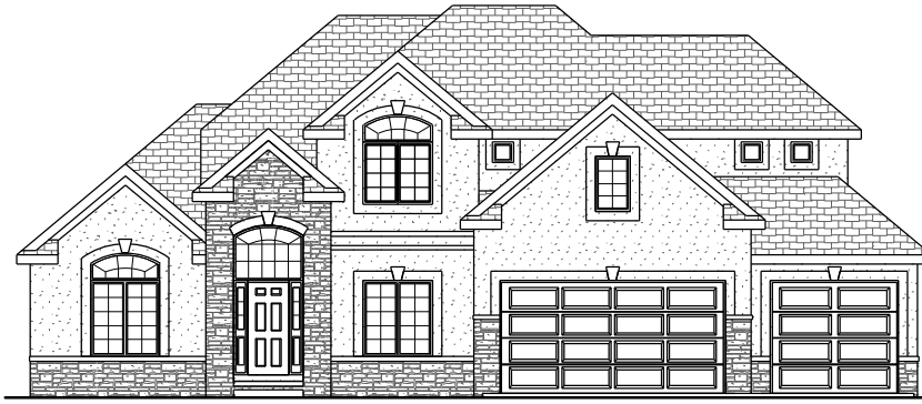
FRONT ELEVATION NY21508