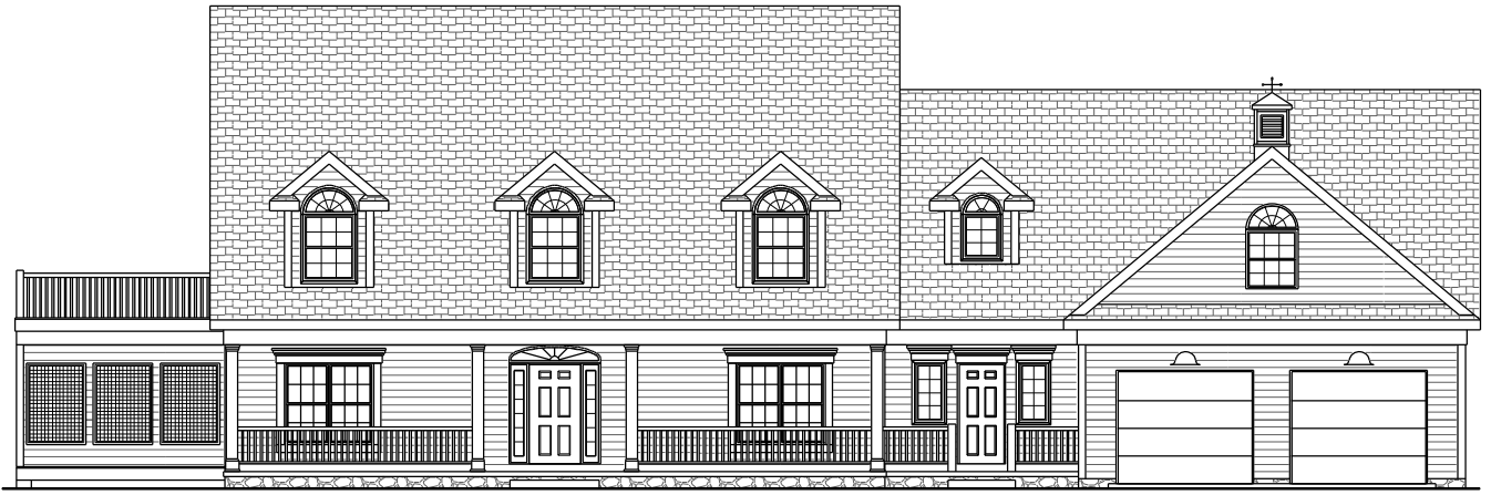
FRONT ELEVATION NV21202