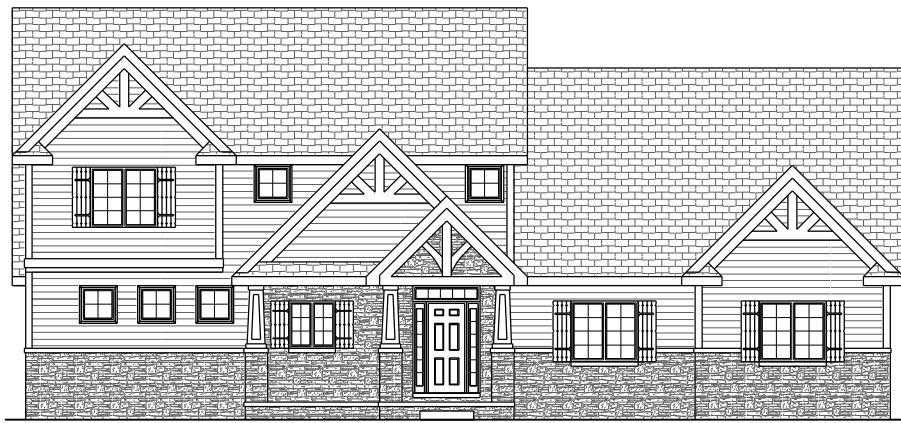
FRONT ELEVATION NV20805