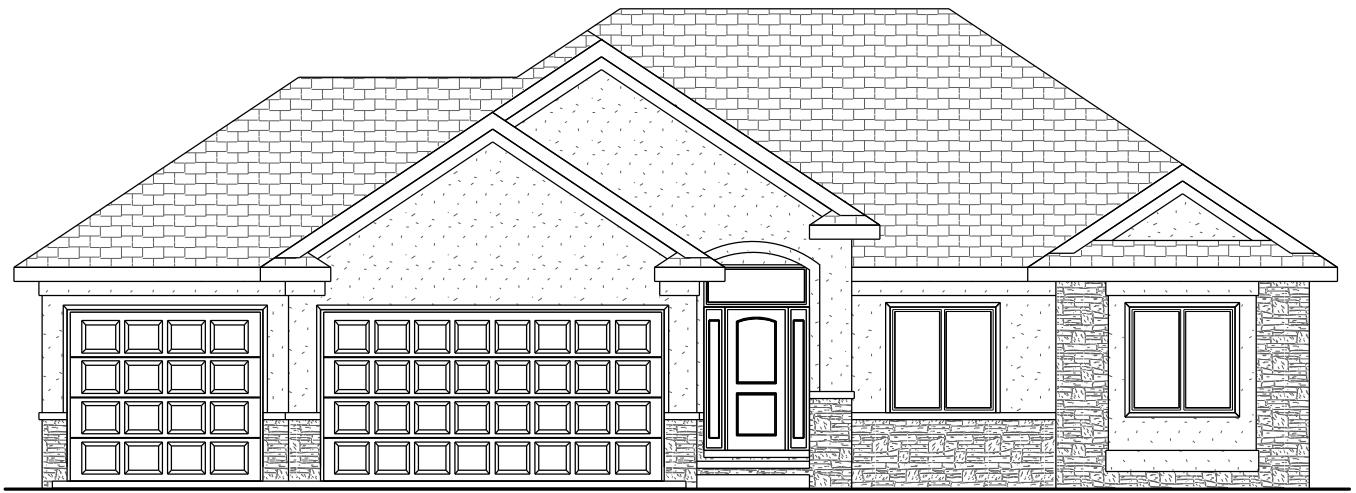
FRONT ELEVATION NV19612