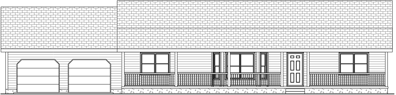
FRONT ELEVATION NV18405