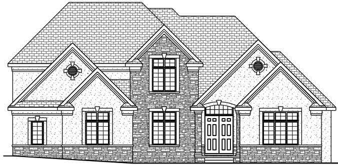
FRONT ELEVATION NV 7810