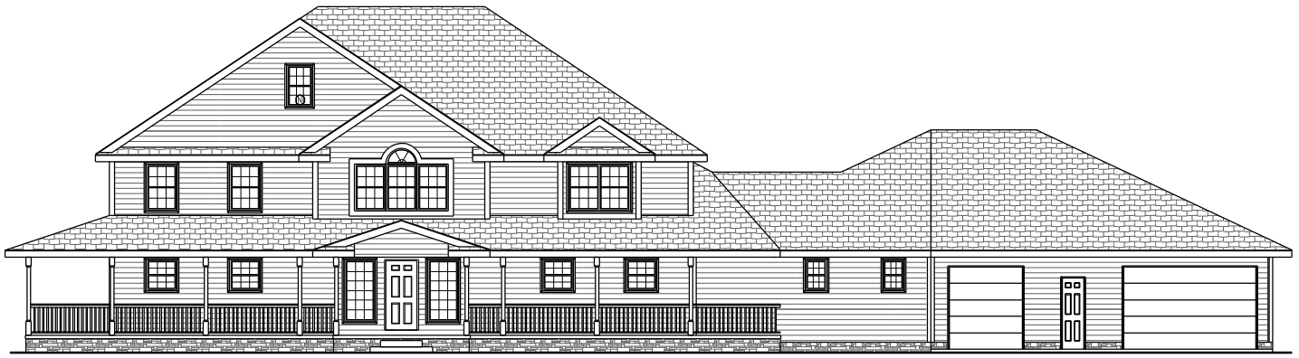
FRONT ELEVATION NV17602