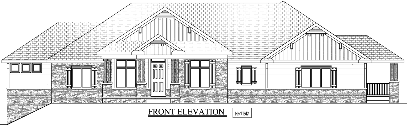
FRONT ELEVATION NV17312