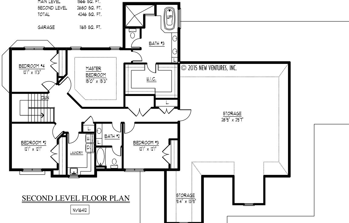
SECOND LEVEL FLOOR PLAN

MAIN LEVEL 1566 SQ. FT. SECOND LEVEL 2680 SQ. FT. TOTAL 4246 SQ. FT. GARAGE 1165 SQ. FT.