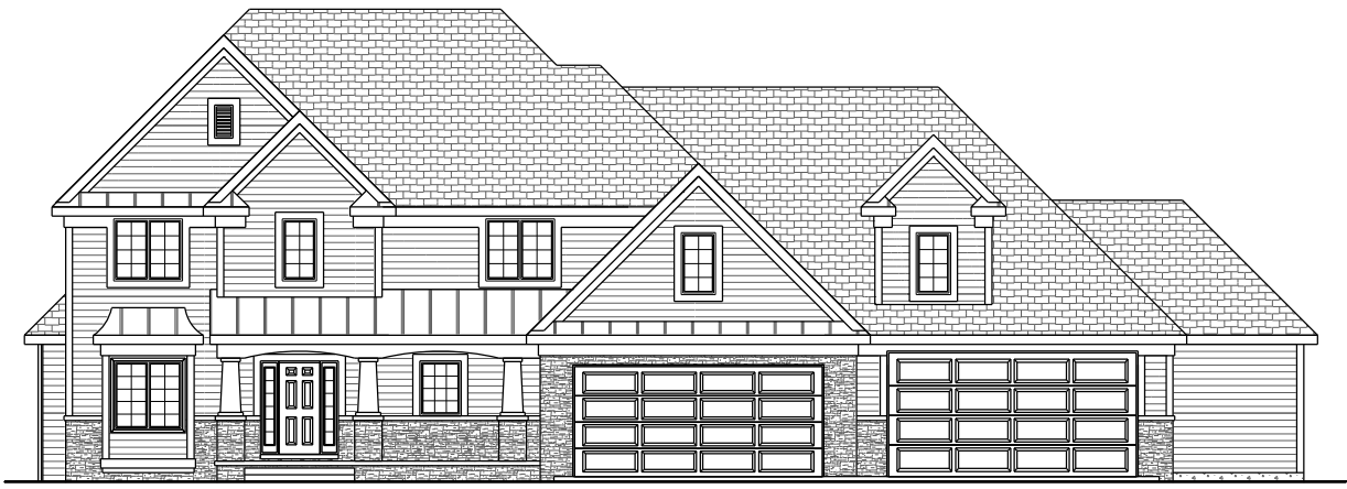
FRONT ELEVATION NV16412