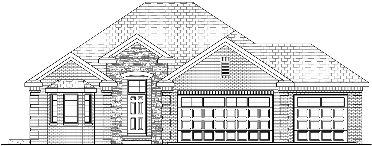
FRONT ELEVATION NV15213