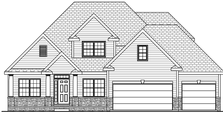
FRONT ELEVATION NY15004