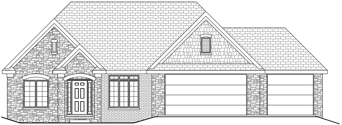
FRONT ELEVATION NV13509