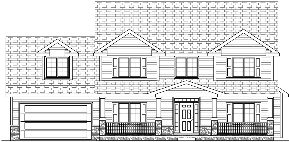
FRONT ELEVATION NV12308