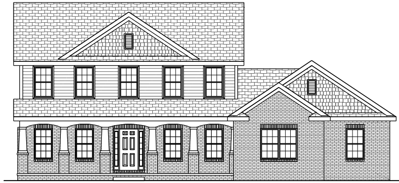
FRONT ELEVATION NV1311