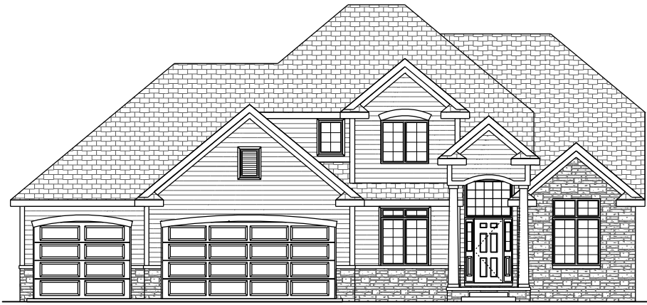
FRONT ELEVATION NV1309