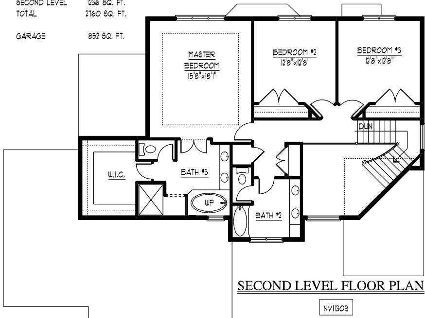
SECOND LEVEL FLOOR PLAN