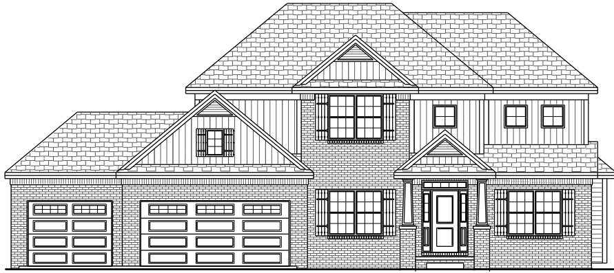
FRONT ELEVATION NV10909