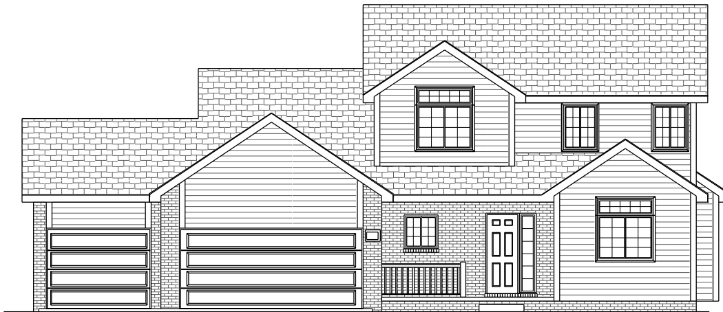
NV09103 FRONT ELEVATION