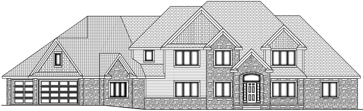
FRONT ELEVATION NV08613