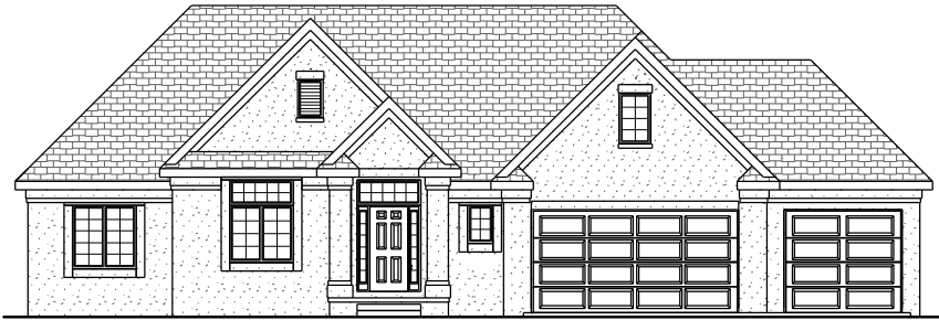
FRONT ELEVATION NVO8210