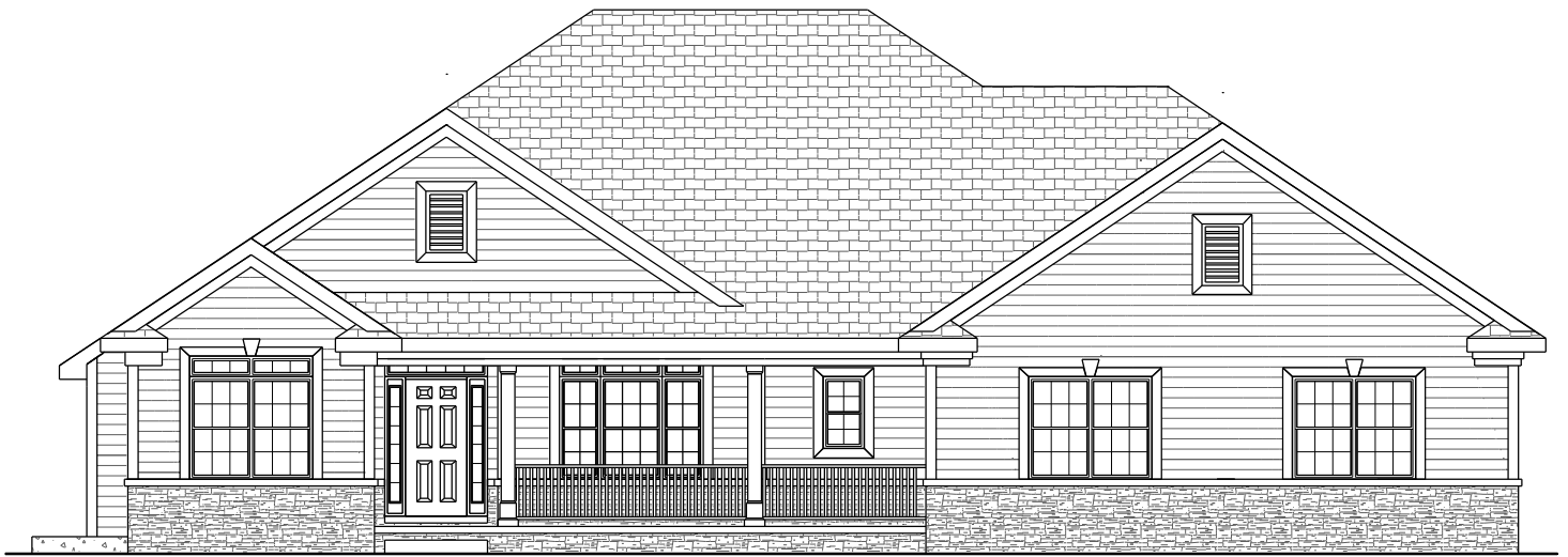
FRONT ELEVATION NV07512