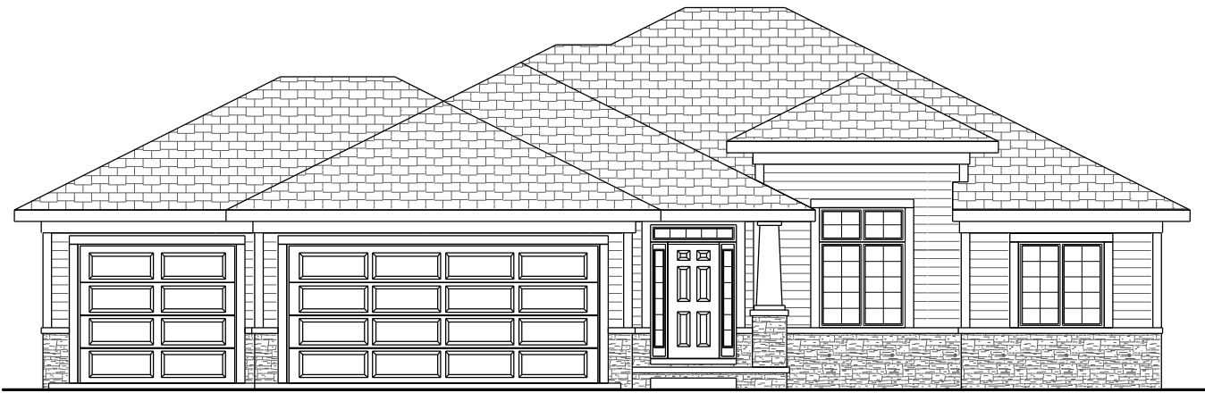
FRONT ELEVATION NV06812