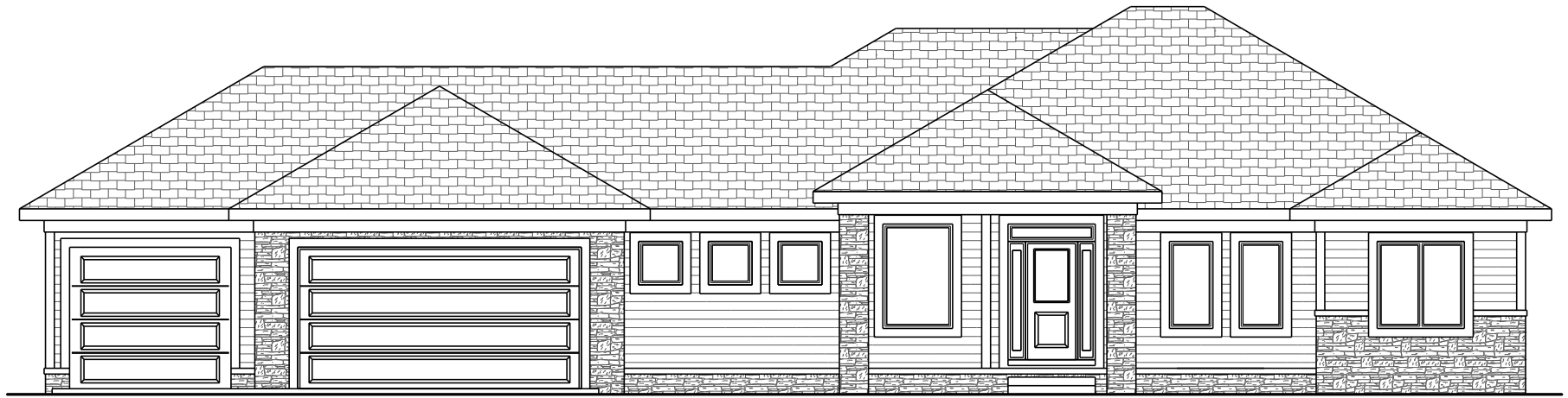
FRONT ELEVATION NV06613