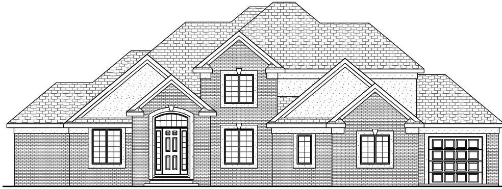
FRONT ELEVATION NVO5911