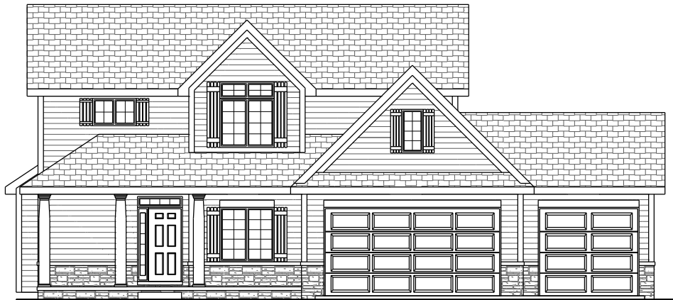
FRONT ELEVATION NV0510