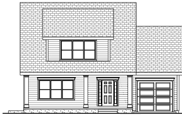
FRONT ELEVATION NVO2012