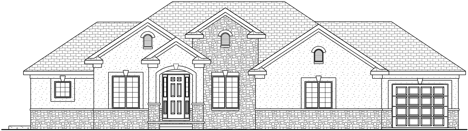
FRONT ELEVATION NV01413