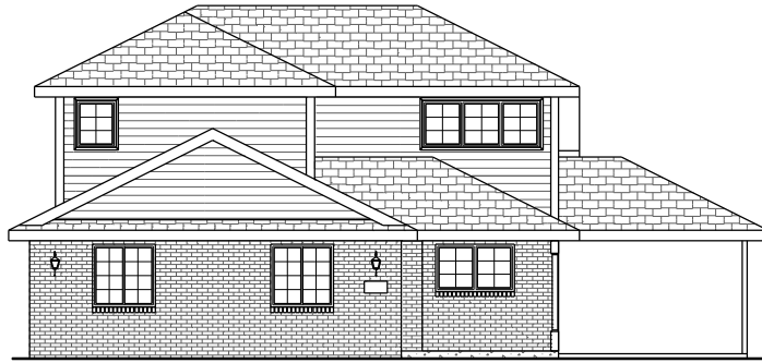
FRONT ELEVATION NY01206